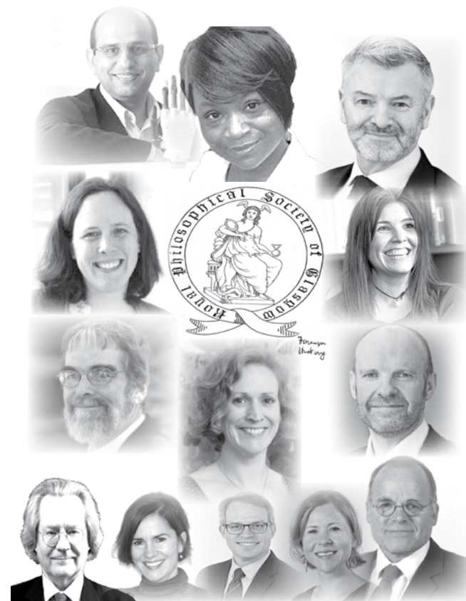
Some of this year's speakers